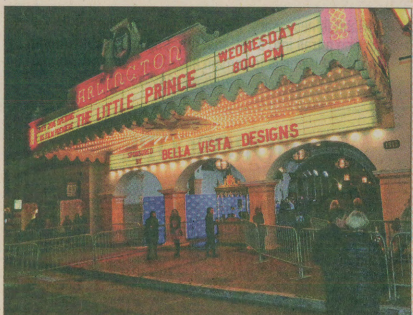
A showing of "The Little Prince" opened the 2016 Santa Barbara International Film Festival on Wednesday at the Arlington Theatre.

"There are many things I loved about 'The Little Prince,'" he said. "I will always cherish the idea that the most important things in life are invisible and the most important way to see the world is with the heart. As you get older, you always have to keep a sense of wonder. Don't let the mundane things take over, petty things. Keep an open eye. That's something we had as little kids. Everything was just amazing. "I hope that throughout the 11 days of the festival, you keep that sense